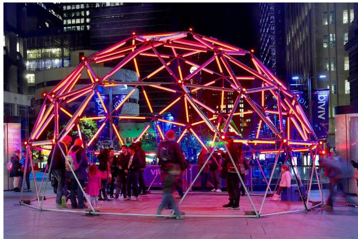
A simple geodesic dome. Notice the dome's truss design, which uses interconnected triangles.

Surface area-to-volume ratio: A comparison of the size of an object's surface area to the amount of space it occupies. As an object gets larger, its surface area-to-volume ratio decreases.